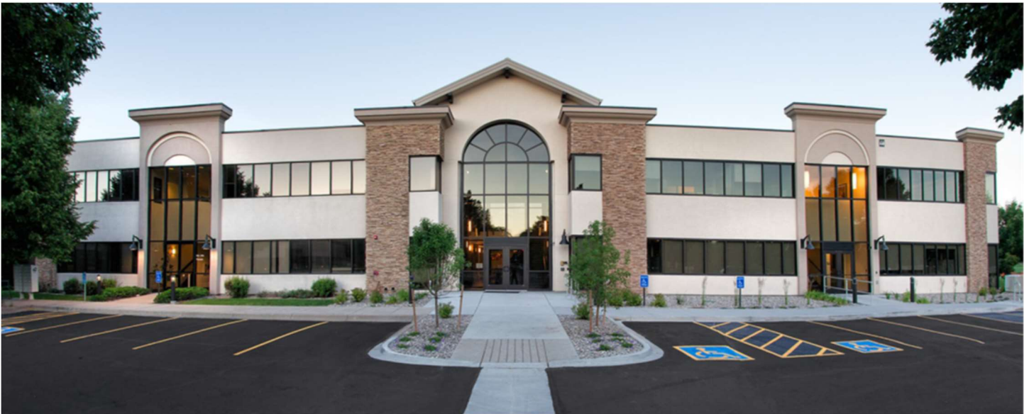
Where you will find our new office